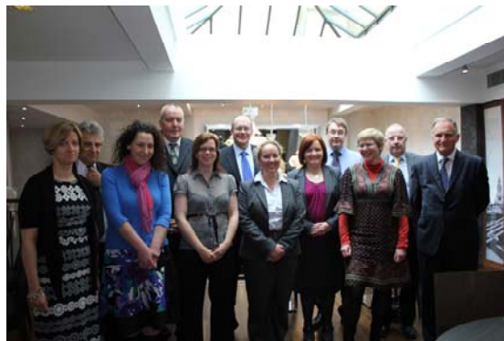
Some of LOCSU's Optical Leads

For the first time, Optics now is in a strong position to influence the system for commissioning primary ophthalmic services in the NHS – thanks to LOCSU's Optical Leads. Following a recent meeting with officials working with the NHS Commissioning Board design and implementation team, the Optical Leads team has been asked to make suggestions on how the emerging proposals for Local Professional Networks could work for optics.